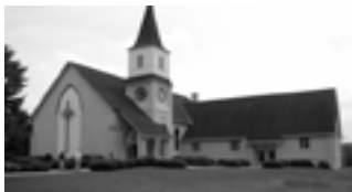
West Koshkonong (ELCA)

At West Koshkonong, a very sturdy eight-sided church was later built. Around this the present West Koshkonong Church (ELCA) was built.