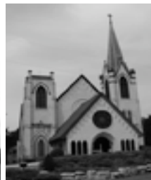
East Koshkonong (ELCA)

Controversies in the 1880s caused division in the congregations, resulting in East Koshkonong Lutheran Church (ELCA), and Western Koshkonong Lutheran Church (ELS).