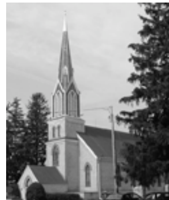
Western Koshkonong Lutheran Church (ELS)

Controversies in the 1880s caused division in the congregations, resulting in East Koshkonong Lutheran Church (ELCA), and Western Koshkonong Lutheran Church (ELS).