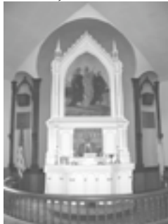
First East Koshkonong Lutheran Church (first Norwegian Lutheran congregation organized in America). This building is from 1893. Note that the pulpit is "inside" the altar.

The first church buildings at Koshkonong were log cabins, both at East and West.