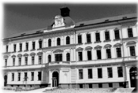
Martin Luther School, Plzen, Czech Republic

1980s Thoughts of Faith begins work in Czech Republic, Ukraine, and Latvia