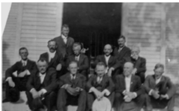
The thirteen pastors who met at Lime Creek in 1918.

1918 The Norwegian Synod of the American Evangelical Lutheran Church (later called the ELS) “re”-organizes at Lime Creek, Iowa “to continue in the old doctrine and practice of the Norwegian Synod.”