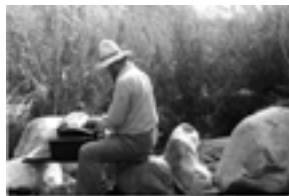
First Missionaries to Latin America