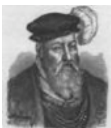
King Christian III

1537 Lutheranism comes to Denmark and Norway through Johannes Bugenhagen and King Christian III.