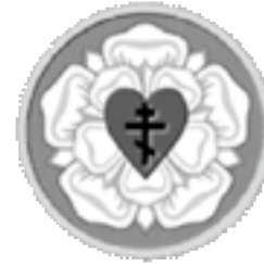
Luther seal with Ukrainian cross