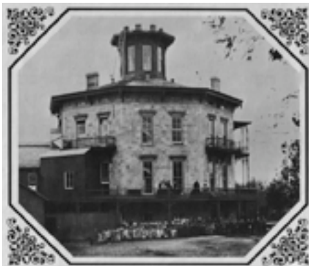
Luther Seminary, Madison, Wisconsin

1872 The Norwegian Synod participates in the formation of the Evangelical Lutheran Synodical Conference of North America along with the Missouri, Wisconsin, and Ohio Synods.