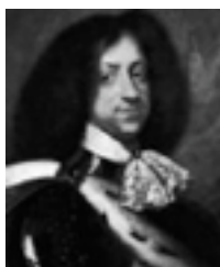
King Christian V

1685 King Christian V orders a slight revision of the Church Ritual