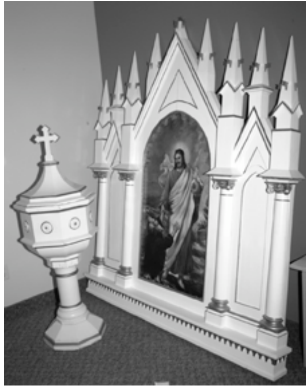
Altar and font from Rose Dell Trinity Lutheran Church, Jasper, MN, are among the many items now in the Ottesen Museum

The Bible says: “Ask for the old paths, where is the good way, and walk therein, and ye shall find rest for your souls.” Jeremiah 6:16. 🌿