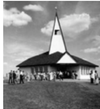
New church in Kekava, Latvia