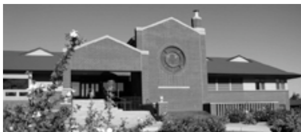
Bethany Lutheran Theological Seminary today