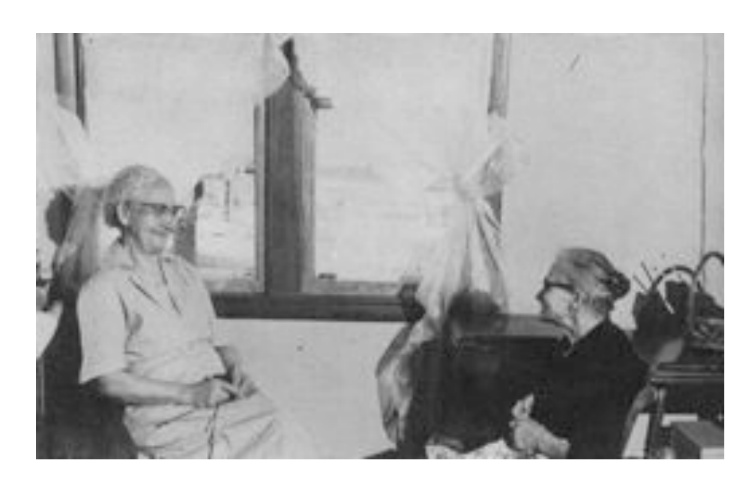
— Oak Leaves – Page 8 —