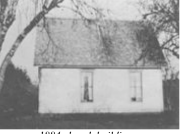
1884 church building

Norwegian immigrants first began to settle in Sibley County in 1855. They settled in the southern part of the county where there was a big woods, and hence the name Norwegian Grove. The Norwegian Grove Lutheran Church was organized on the first day of February 1881. Prior to the organization of the congregation, members had been attending services at Norseland where a congregation was organized in 1858.