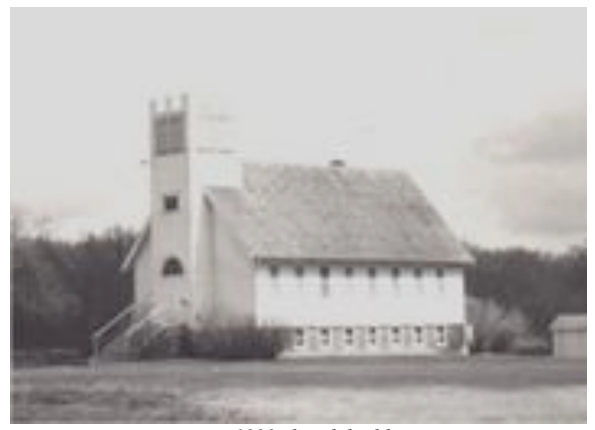
Is twas on an autumn day in 1929 when a new church building was completed. To

members. The site chosen for the new church was conveniently located as the members all lived within a five-mile radius of it. The church was only about 20 feet by 30 feet in size, and consisted of one room, with a small sacristy, built out at the west end. Two doors, one on each side of the altar, led from the church to the sacristy. Between the two doors was a small door leading to the altar. There was only one outside door. Just inside the door, to the left, stood the stove. It was a long, black, narrow stove with a large drum on top, through which the smoke went before it passed into the stovepipe which extended the full length of the church to chimney. There was a narrow aisle up the center of the church, and on each side of the aisle were rows of pews extending to the wall. Extra pews stood against the wall in the front for the Sunday School pupils. At the back of the church there was a pew facing the stove. People could sit and warm themselves there or use it if the church was full. Women, and children under confirmation age, sat on the left and men and boys sat on the right side. On one Sunday in May 1896, Pastor Johnson's son, who was a student in the seminary, was to conduct the Service. He rushed into the church and announced that he had arrived before the coming storm-and fell over dead.