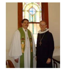
"Founders' Service" – February 4, 2006

It is yet with gratitude that the congregation acknowledges the many special gifts which have been received over the years for the building and improvement of the church property. And as the congregation looks back on over a century of God's blessings it says as with one voice: "Not to us, O LORD, not to us but to your name be the glory, because of your love and faithfulness" (Psalm 115:1).